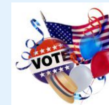
Photo ID will be required.

The General Election will be November 6th.