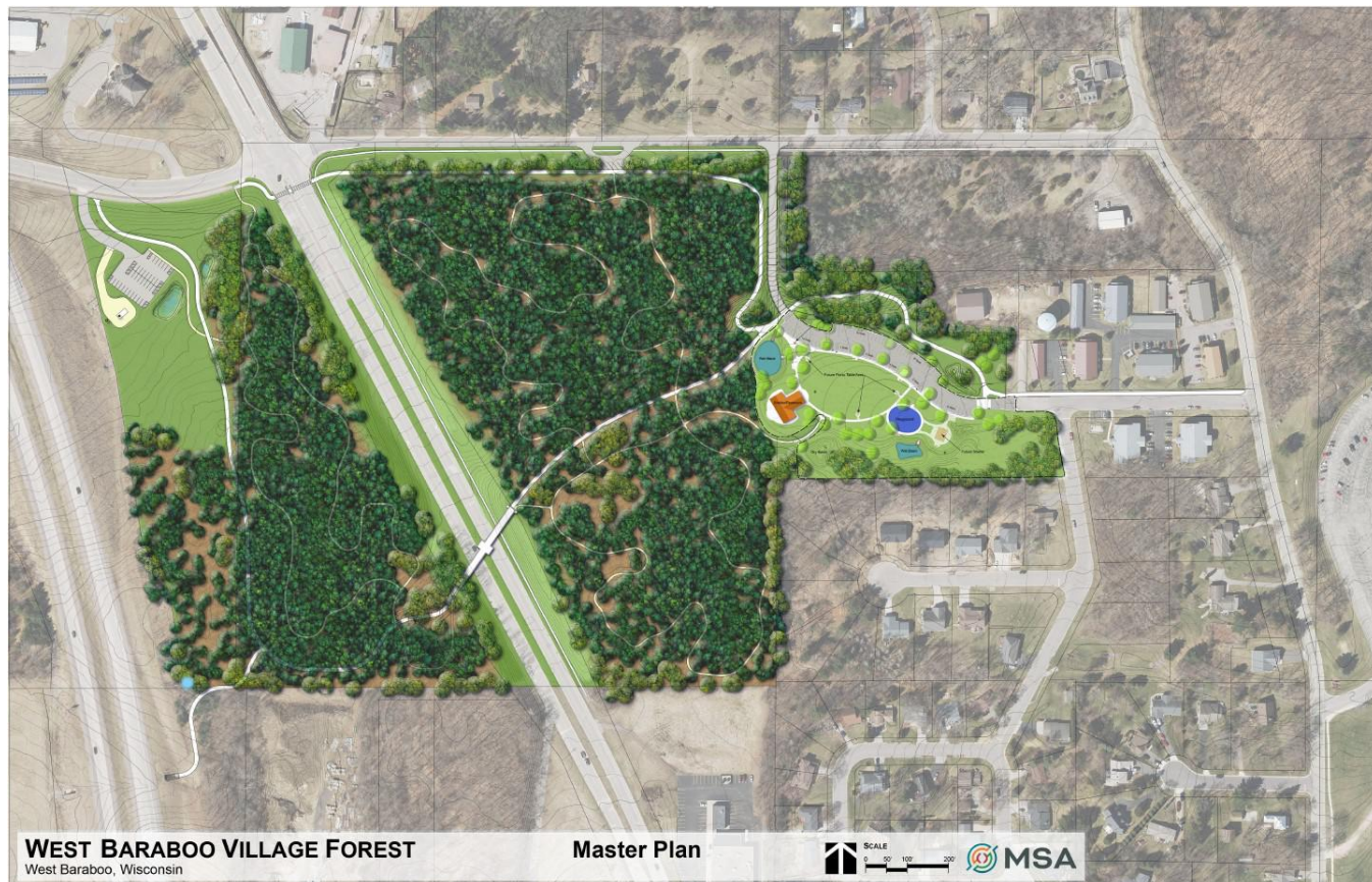
WEST BARABOO VILLAGE FOREST West Baraboo, Wisconsin

shelter with kitchenette and restrooms, large multi-story playground, connecting sidewalks, parking area, site lighting, and open green space. The Village continues to plan for the future phases of the project by considering additional funding sources to help offset the costs. The Village is applying for 2 more additional grants to help construct the main trail through the park that would connect the Ice Age Trail into the park to make it a trail head. The Village is also discussing with the County as to how the Great Sauk Trail can make a connection to the park was well so the new park space will be recognized regionally and nationally. The overall site construction shall be wrapping up mid summer to late summer. - Raine Gardner, MSA