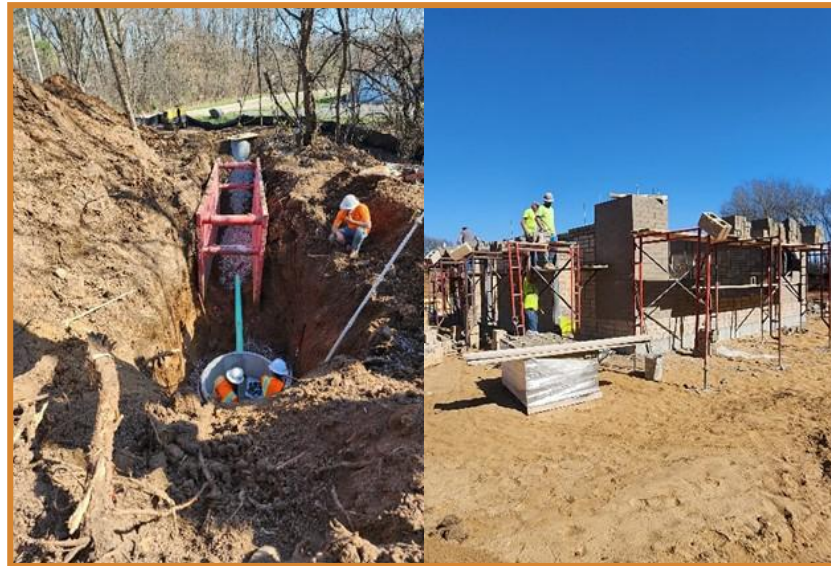
Sanitary Sewer Installation and shelter masonry construction.

The Village has begun construction on the new Village Forest Park Project. The overall clearing and grubbing of the site was completed in Fall 2022. The new shelter and overall site construction has really started to take off this Spring with utilities getting installed on the site and the park shelter/pavilion has begun vertical erection with masonry work. The majority of the site earthwork will take place in May to prep for the new parking lots, sidewalk and playground area. The new park will include a new open air