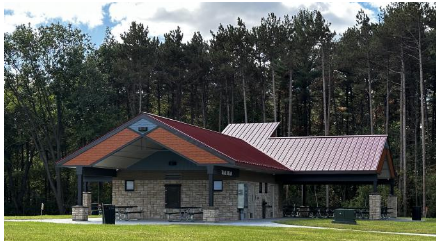
New pavilion at Village Forest Park

The Village is building the 1st leg of the trail connection along Zajak Road and into the park that is along the dedicated Ice Age Trail. In addition, the Village hopes to also get this section of trail dedicated as the Great Sauk Trail (GST). The Village has been working with the County to hopefully get this route dedicated as part of the GST. This section of the trail is planned to be constructed later this Fall.